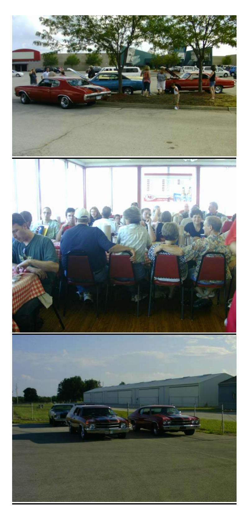
Cruise to We B Smokin on August 14<sup>th</sup>. We met at the Great Mall and headed south on U.S. 169 to Paola, KS.