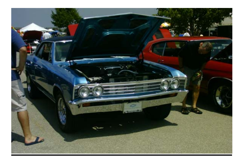
Olathe Bible Church Car Show Several members got together impromptu for the Olathe Bible Church Car Show.