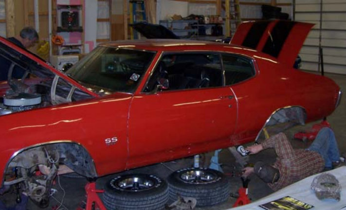
Ron Brightwell tackling removal of the differential.