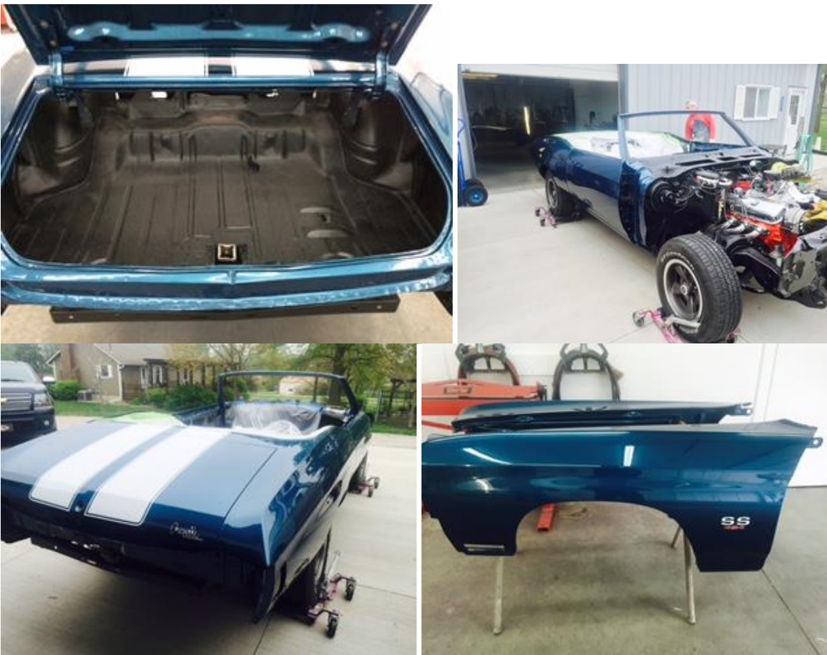
Here are some pictures of the car being assembled.

Like any restoration there are some problems along the way with fit up and alignment. Jim did assemble the car before painting, but there was an issue with an aftermarket fender having a twist in it that had to be worked with to fit like it needed to. These things happen along the way, but they do have a way of working their way out. Fit up is so important when reassembling a car. I have learned so much watching Jim do this. So many cars I have seen look good from a distance, but up close tells a different story on how good the restoration really was.