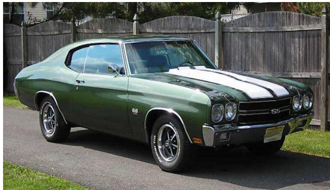
THE CAR.... responsible for my Chevelle Infliction

That’s another story, for another day!!!