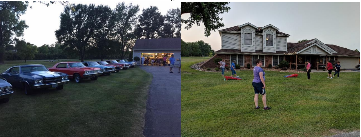
August 11, 2018, Merriam Saturday evening Cruisin