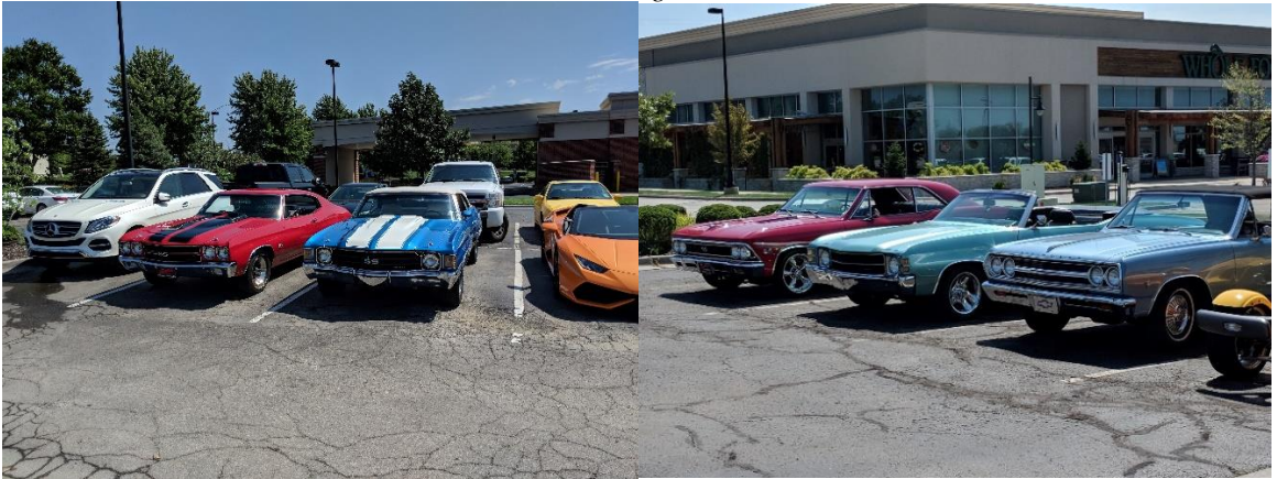
August----26: Cruise the K, Sunday Event