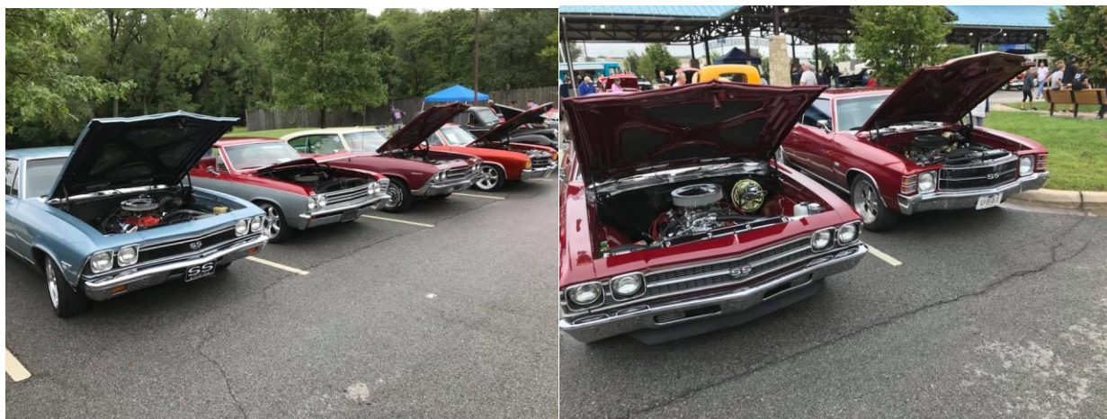
September----15: Ol'Marais River Run Show Ottawa, KS