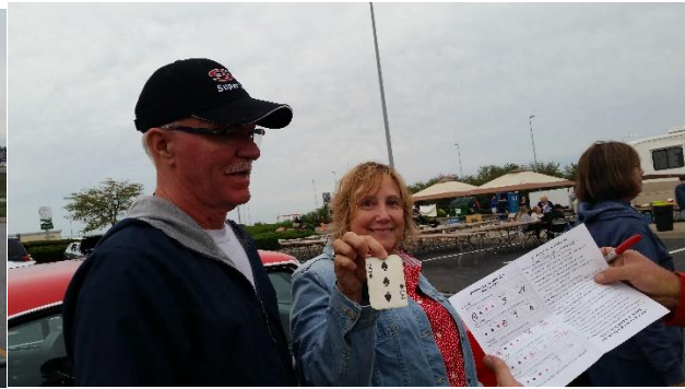
2 nd Place