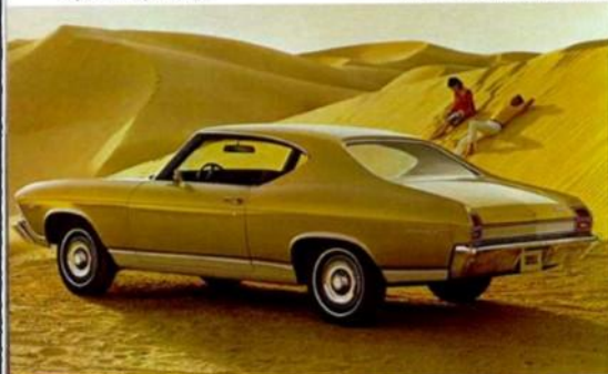
SS 396 Sport Coupe with Sport Stripping