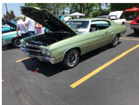
Leo Storoz original 1970 LS5

Pictures of some of the club members cars