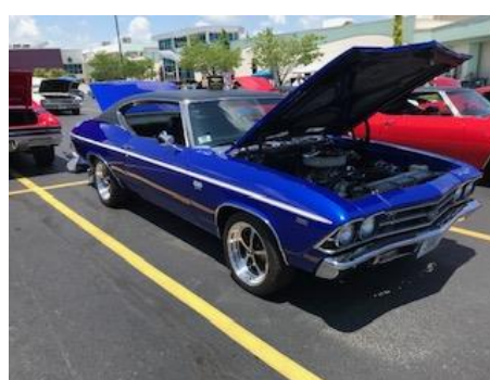
Jackie Paris 1969 freshly painted SS396