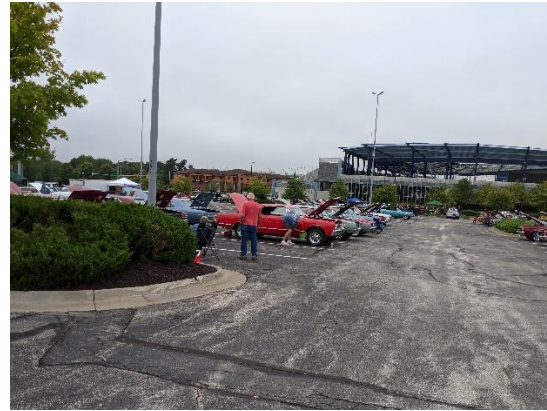
Best of Show