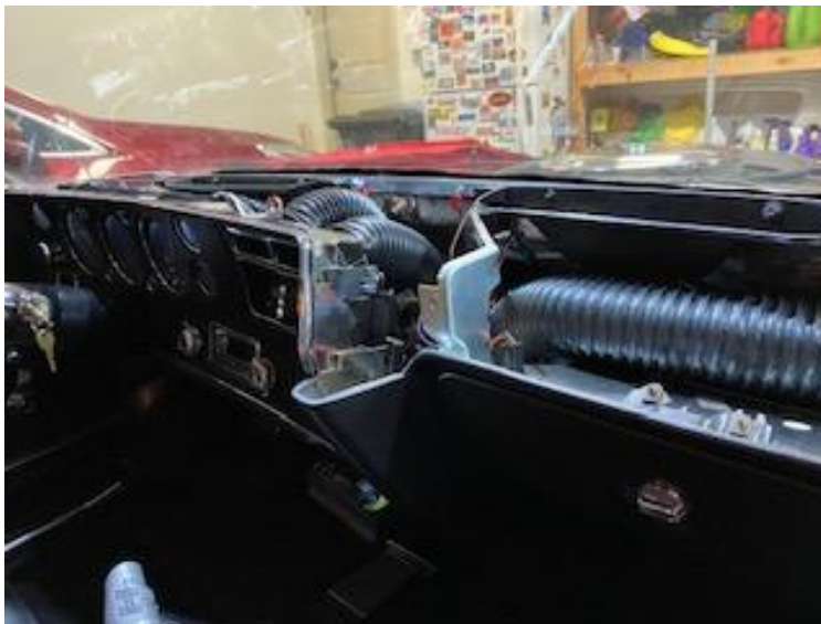
This is a picture of the dash reinstalled and the flex hoses that supply the air to the dash grilles. There are two for the defrost boots and four for the vents in the dash. It does get kind of tight under the dash pad but they will fit with a little persuasion. While I had the dash out, I also put in a new circuit board in for the dash and LED lights. I also installed a