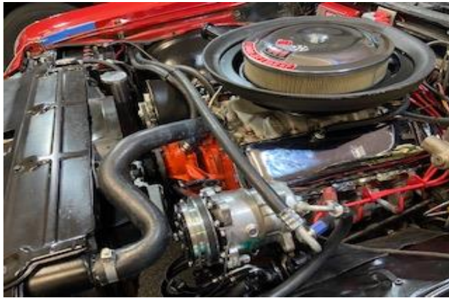
This is picture from the other side. As you can see it makes for a pretty clean installation.