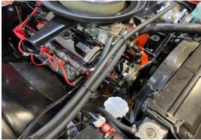
This is a picture of the routing of A/C lines and heater hoses.