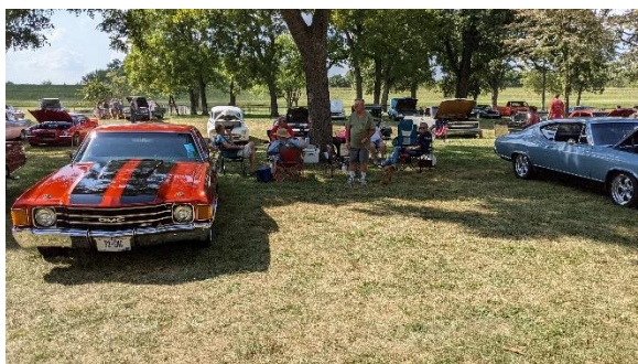
September 25--- MACC annual Car Show