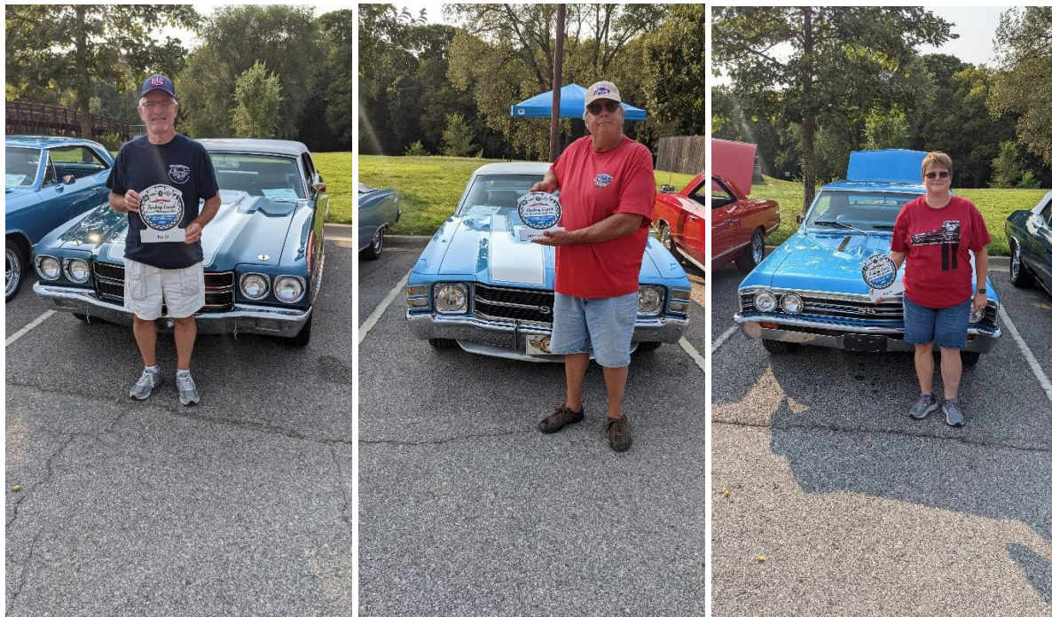
September 12---Wheels and Dreams Show Shawnee – 6 members participated.