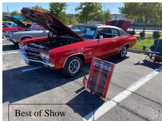
Best of Show