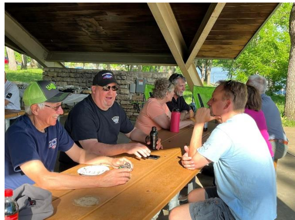
June 11-Paola Car Show Paola, KS – 17 members (Cars).