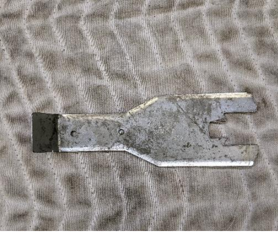
Door Handle Clip Remover