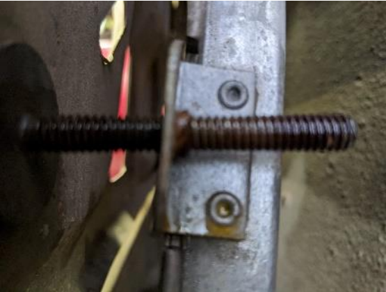
Lower channel adjusting stud (#17) NOTE POSITION