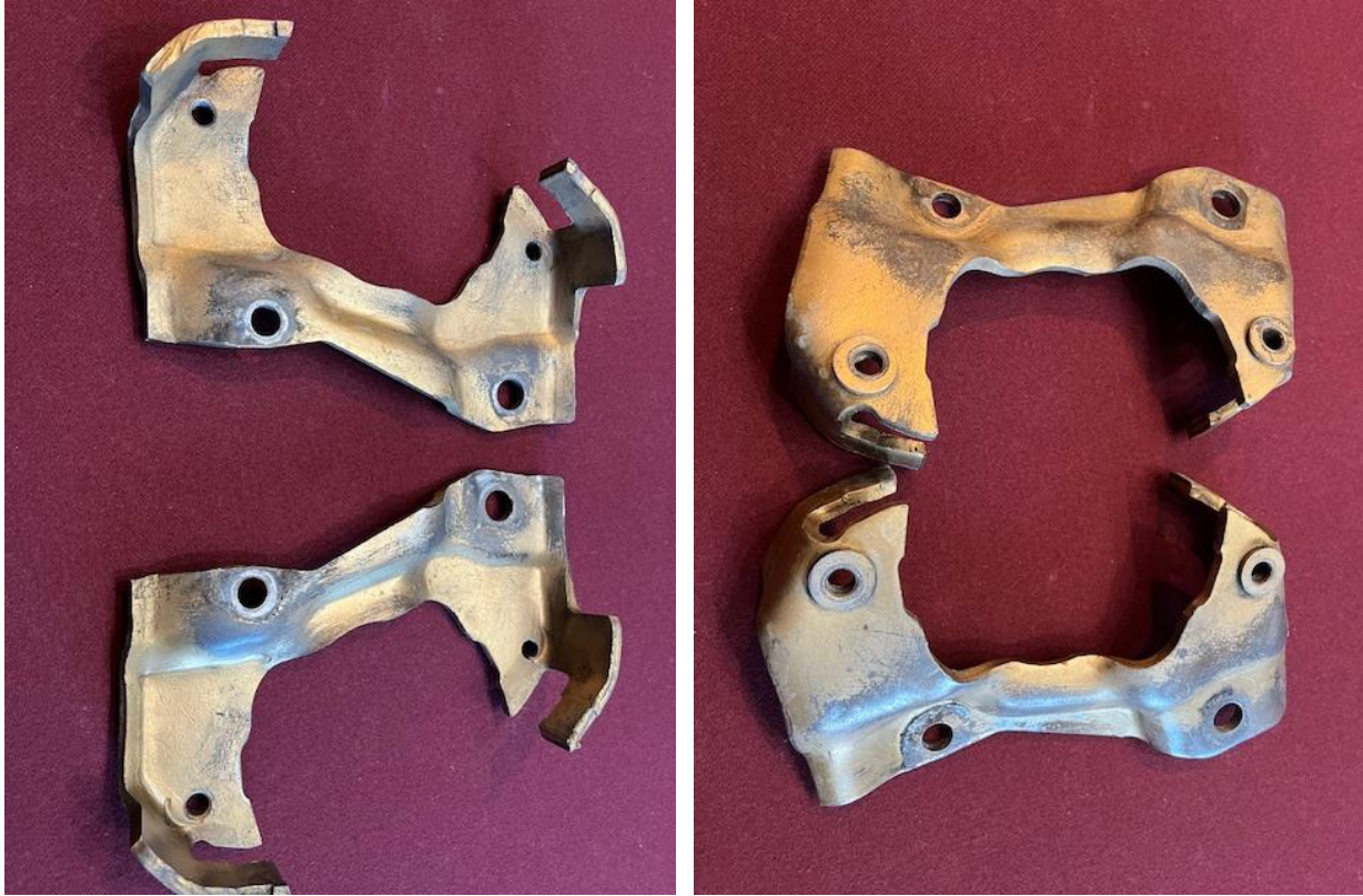
Rear control arm brackets for 70-72 Chevelle. Great condition $50