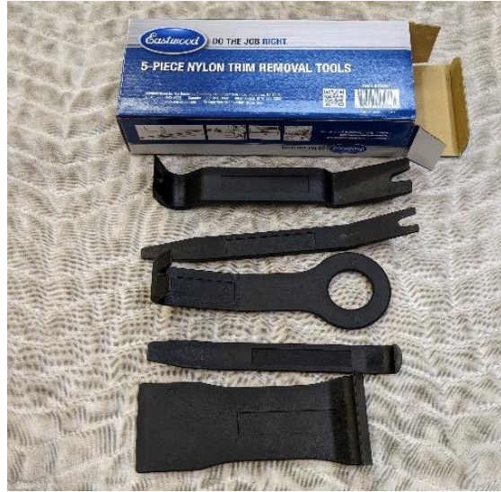
Trim Removal Tools