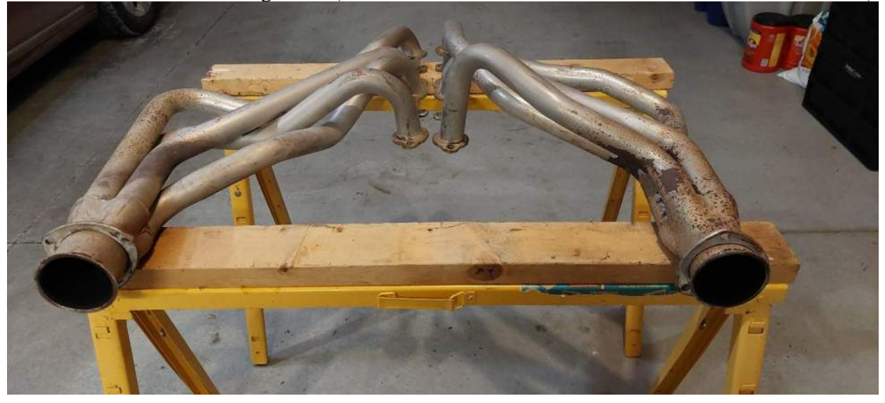
SBC headers need refinishing. $100 (These came off his 1979 El Camino with a 400 small block).

Holley 770 Street Avenger carburetor. $300 OBO