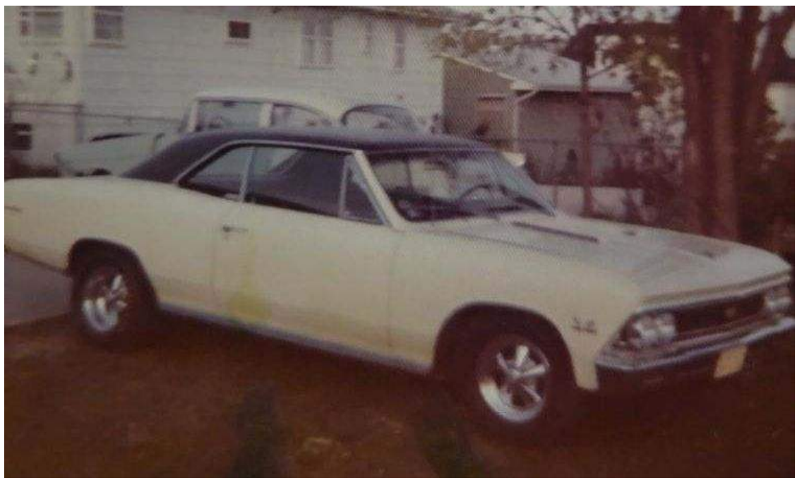
The high school cruiser (notice the family '55 in the background)

In high school I was a proud kid with a Super Sport Chevelle. Life was good and many great memories were made with my buddies working on our cars and cruising HiBoy's on Noland Road and Peter's Drive Inn on State Avenue. A few drag racing passes down KCIR were also made. After heavy persistence from a good friend, I sold my Chevelle to him. He immediately installed headers and an L88 cam, making it a great street performer in the KC Northland.