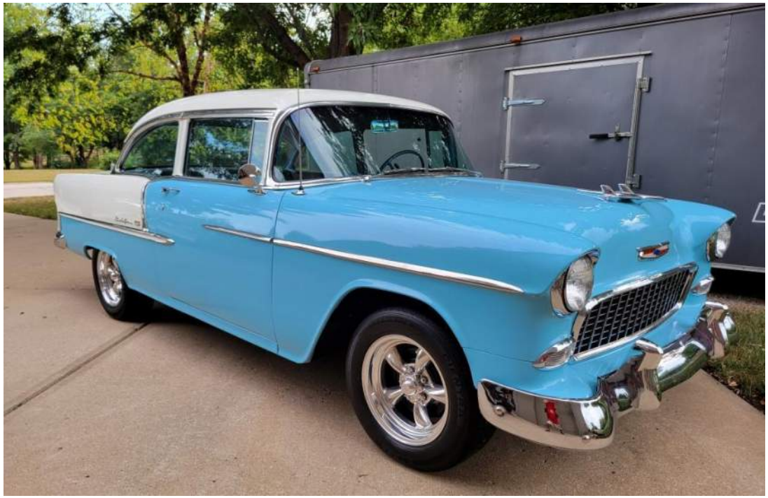
The family '55 today

In high school I was a proud kid with a Super Sport Chevelle. Life was good and many great memories were made with my buddies working on our cars and cruising HiBoy's on Noland Road and Peter's Drive Inn on State Avenue. A few drag racing passes down KCIR were also made. After heavy persistence from a good friend, I sold my Chevelle to him. He immediately installed headers and an L88 cam, making it a great street performer in the KC Northland.