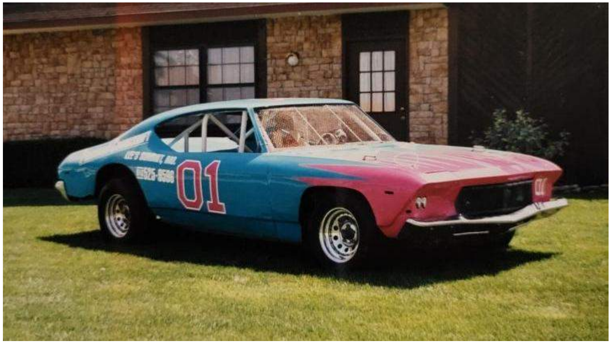
The '69 dirt track racer