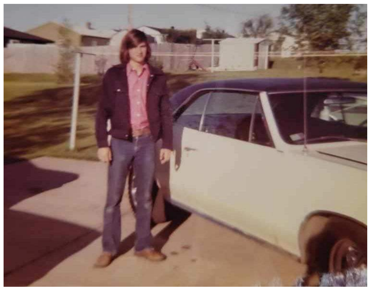
The last day of high school

Not to be my one and only Chevelle, years later during my young adulting life, a friend provided me a lead on a 1967 El Camino with a 396 and loaded with options. This car (or truck if you prefer) revived my Chevelle/ El Camino passion and would lead to many more projects over the years since. On a whim, a neighbor and I built a 1969 Chevelle Super Stock dirt track car that we ran for two years. This was certainly a bad decision for keeping Chevelles alive for future generations. The weekly damage and work made me realize that I prefer making them pretty, rather than muddy and making junk parts. Please forgive me. Hopefully, some of my more recent projects have saved some Chevelles and El Caminos, given them new life for others to enjoy, and made up for past deeds. I am looking forward to working on two more future project cars that are just waiting for my attention.