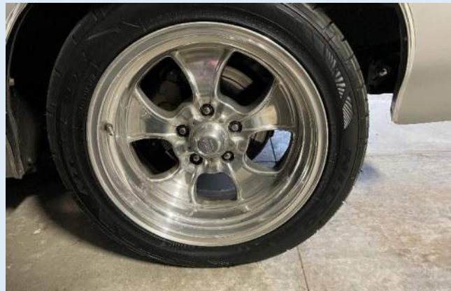
What Wheels Would Look Like W/O Painted Spokes

Intermittent wiper module for recessed ( hidden ) wipers. New, never used. Wiring this module to your existing wiper motor gives you intermittent wipers using your stock switch. Instructions included. Check out the company website at www.revolutionelectronics.com $50