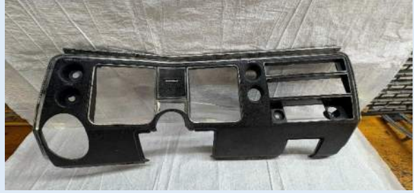
1968 Chevelle Instrument Assembly. $300