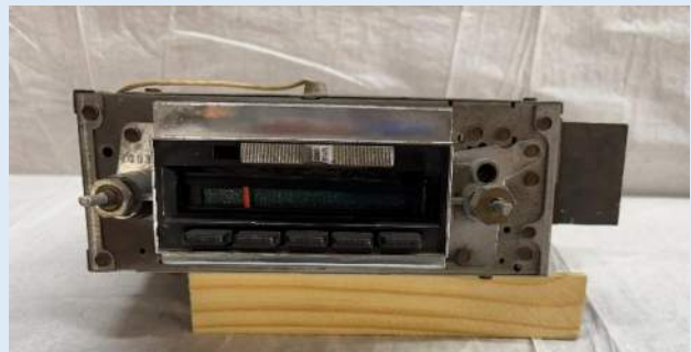
1968 Chevelle AM-FM Slide Bar Radio. $100