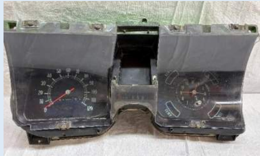
1968 Chevelle Panel. $100