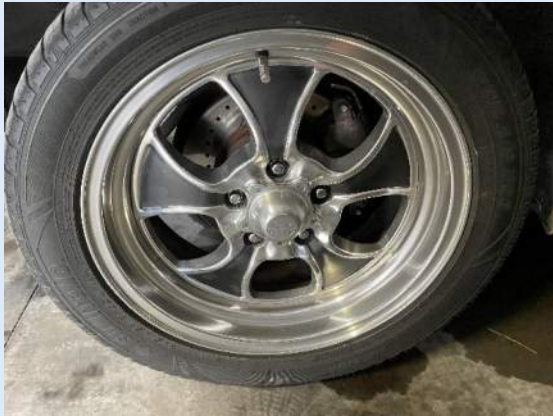
As Wheels Look Now