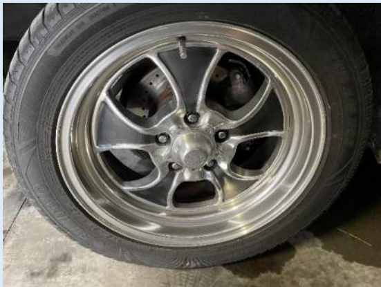
As Wheels Look Now